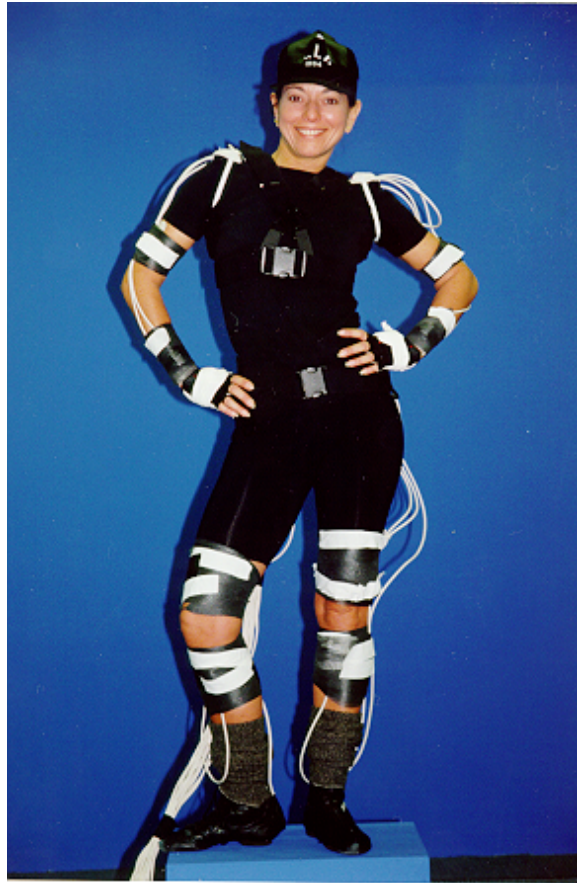
Figure 5: A performer wearing a motion capture apparatus. The device shown is a full body magnetic tracking system.