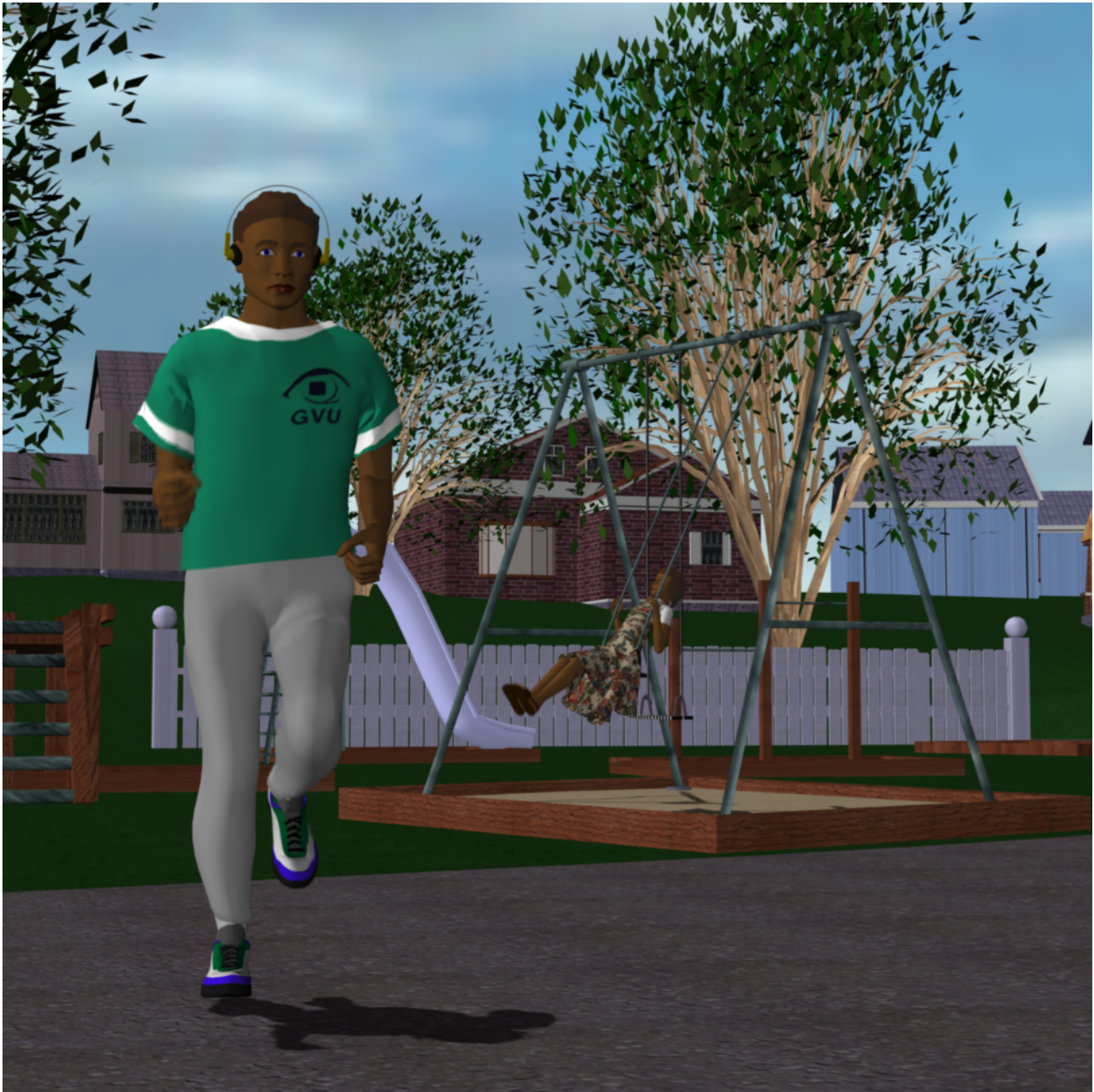
Figure 4: Runner in a park: All the objects in this image were animated using dynamic simulation. The runner and the child on the swing are active simulations governed by control systems. The clothing is a passive system that has been coupled to an active system.