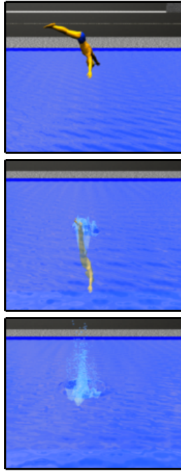
Figure 3: A diver entering pool: These images show the combined use of an articulated model, a deformable model, and a particle system.