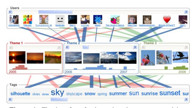
Figure 1: The interface for browsing themes extracted in a Flickr group. A group consists of time-dependent themes having similar patterns of image content and context (users, tags and post times). The thickness of a line between a theme and user or tag indicates how likely a photo in the theme is posted by the user, or is associated with the tag. In each theme, the bars over timeline show how likely a theme photo is posted at the time. The interface allows an effective exploration of typical group photos over time.

We conjecture that these challenges can be attributed to the time-evolving patterns of the relationships among photo content and context in the groups. We define a group photo stream (or group ) to be a collection of photos posted in a Flickr group pool (http://www.flickr.com/groups/), and all the users (who posted