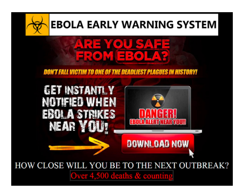
Figure 2: SE ad for Ebola early warning system.

Using our categorization system we classify this attack as "search:entice+decoy+impersonate." Search is the method of gaining the users attention. In this example this is obvious because the SE page appeared in the results page provided by a search engine. The entice part of the attack is the offering of "free" pics of the subject of interest. Decoy is due to the fact that blackhat SEO was used to elevate the SE page in the search results above other legitimate pages. Lastly, what the user downloads is not pics of Gary Roberts; instead, it is a malicious executable impersonating what the user wants (e.g., Gary