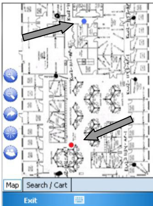
Figure 1. Auto-zoom feature. The red dot* (lower) denotes user's current location and the blue dot* (top) denotes user's destination.

Path Visualization (+, +/-, -): The fastest or shortest route is indicated as a colored line between user's location and destination. This route automatically updates as users change their location, resulting in less navigational and mental strain on the user. The user can also manipulate the route in the display.