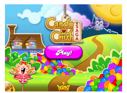
Figure 2. Snapshot of Candy Crush's starting UI

Figure 2 presents the first UI to which users need to respond by clicking the "Play!" button. Although such testing behaviors look naïve to humans, they seem not well supported by Monkey testing. Two possible reasons can explain such insufficiency. First, Monkey cannot read dialogs, neither can it smartly make decisions or enter necessary information to proceed in the game. Second, Monkey does not know the game rules. It does not recognize candies, so it cannot move mouse around to drag-and-drop candies. Consequently, Monkey cannot play the game for testing.