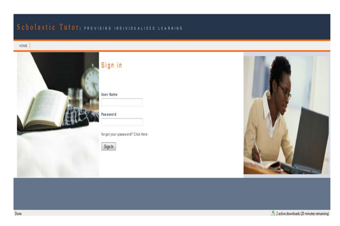
Figure: 1 GUI for the sign in page of Scholastic tutor

The teaching model is the pedagogical agent of the system and it executes the actual teaching process. In logical sense this module lies in the centre of the system and by communicating with the other modules it provides adaptive instructions to the students. It is rule-based, where the rules define the teaching strategy. The rules are author-able that enables the teaching model to be customized. The features of the authoring tool have been extended to support the modification of the teaching model. A domain expert can utilize this facility and apply her skills in reorganizing the teaching method to suit in different environments.