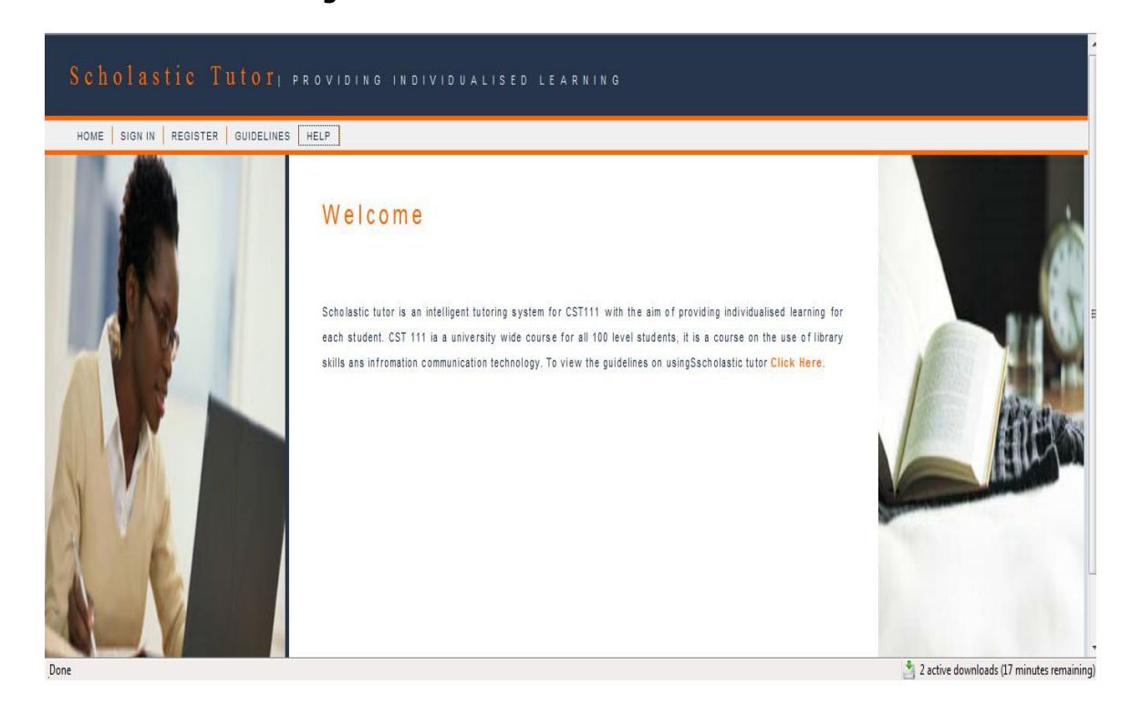
Figure: 3 Graphic user interface for the Home page of Scholastic tutor

Graphic interface: this is responsible for user interaction with the intelligent tutoring system. It controls the communication between the learners, teachers, and the system as well as following up the behaviours of them. Then the information is sent back to the student module afterwards. IT is the gateway of the system for communicating with the student. All the learning materials and test sets are presented to the student through this interface and test results are fed back to the system for assessing the student.