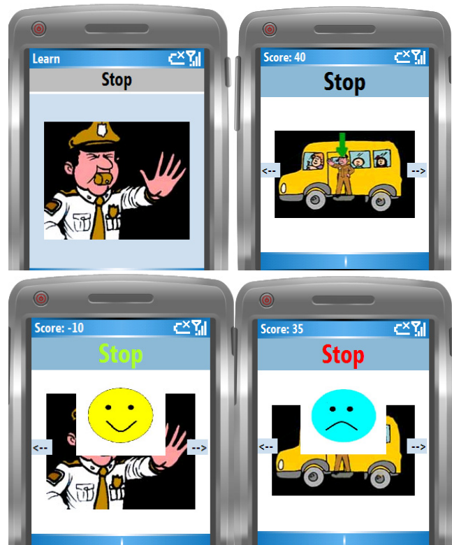
Figure 2. An activity and its user-interface that is an instantiation of the “Written Word→Semantics Association” design pattern from Figure 1. Starting from the top left, in clockwise order: (a) the player is taught the meaning of “stop” with a corresponding picture, (b) tested if she remembers what “stop” means, (c) selects the wrong picture for “stop”, and (d) finally selects the correct picture.

Design patterns are necessary but insufficient. Our goal is not only to promote the reuse of existing patterns, but also reuse learning activities which implement these patterns. This extent of reuse is crucial for developing regions since activities and their user-interfaces may require several iterations before they are appropriate for the users’ cultural backgrounds and low levels of computing familiarity.