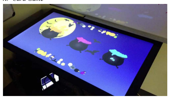
Figure 1. Tech-or-Treat card game