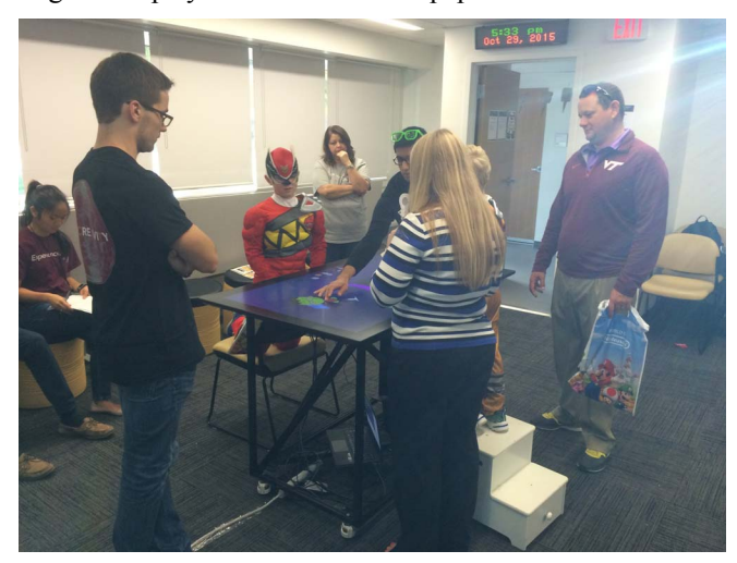
Figure 3. Tech-or-Treat game setup

Our game was set up in a learning studio where the visitors to the event can come up and play (Figure 3 shows the activity setup). The studio is one of the exhibit rooms to present Halloween-themed technologies. Throughout the event, one research member stands around the table to give general instructions on how to play the game. Another two research members recorded system usage. One research member counted the number of visitors, including children and their parents. The time when they come up and leave time were noted. Another research member observed and took notes of the children's interactions with the game. The data was recorded in three parts: collaboration mode, observed behaviors and description of the activity. Collaboration modes included playing individually, playing collaboratively, and playing in conflict, thus giving an overview of how children collaborate in the shared space. The 7 behaviors included exploring, showing, creating, sharing, fighting, challenging and teaching; thus describing basic activities with the technology. The brief description gives general information about how the visitors play the game. The two research members sat close to the game display and made notes on paper.