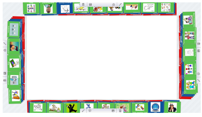
Figure 4. A screenshot of the card-based design system

The design cards used in this study are created based on three workplace factors—social context, activities and artifacts—as described in the design requirements. Accordingly we designed three types of cards corresponding to each of the dimensions: problem cards, activity cards and technology cards. Each design card has an image illustrating the content of the card, with a word or a short phrase describing the problem, activity or technology placed below the image. Different background colors differentiate design cards of different types.