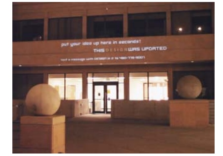
Figure 2: The scale of your _____ here relative to the building on which it was initially implemented.

The goals of the project were multifold. Firstly, we wanted to allow the broader community (students, faculty, staff, visitors) to submit their own suggestions as to what the word/concept/practice of DESIGN meant to them. Secondly, we wanted this process of community interaction to occur publicly, in a way that would complement other forms of public discussion such as Twitter messages, townhall meetings, discussion forums and email lists. Your _____ here fills a unique niche that is not addressed by these more "traditional" methods: by its situation in a public plaza and the immediacy of feedback response, Your ____ here encourages interaction on a relatively unlimited timescale from any user equipped with a mobile phone. It is as accessible to the general public as a billboard, but is capable of accepting input at any time from