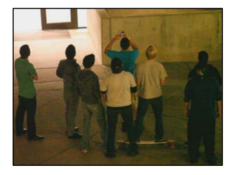
Figure 4 : A number of users observing and interacting with the system. Note user taking a photograph with his mobile phone.

Figure 3 : System diagram. The web client is used only for administration (eg., removal of profane messages that passed through the blacklist) and is not user-facing.