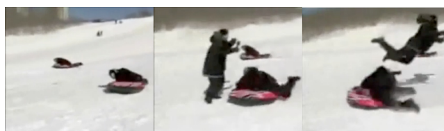
Figure 2 Sequential screenshots from question 1 of the Computational Thinking Pattern Quiz wherein 2 sleds ‘transport’ 2 people down a hill and one of the sledders ‘collides’ with a person at the bottom of the hill.

Question 1 is a video of 2 people sledding down a hill. At the end of the video one of the sledders collides with a person standing at the bottom of the hill. The patterns depicted in this video are ‘transportation’ and ‘collision’ and the participants were specifically asked how this related to something in the “Frogger” game. Figure 2 depicts sequential screenshots of this video as an example as to what these videos looked like. Participants were given credit if they correctly identified either one of the patterns.