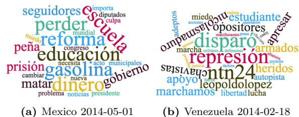
Figure 2: Word cloud representing censored keywords in News identified by our method

Mexico May 2014. In December 2013, Mexican president and Congress amended the Constitution, opening up the state controlled oil industry to foreign investors. Tens of thousands of protesters demonstrated in Mexico City on Labor Day (May 1) to protest against the energy reform. In additions, protesters were also unsatisfied with the 2013 reforms of the educational sector. However, this incident was not reported in a number of influential newspapers in Mexico, which is an indicator of censorship. Fig. 2a shows a cluster of censored keywords detected by our method around May 1, 2014 in Mexico. Our approach has successfully captured con-