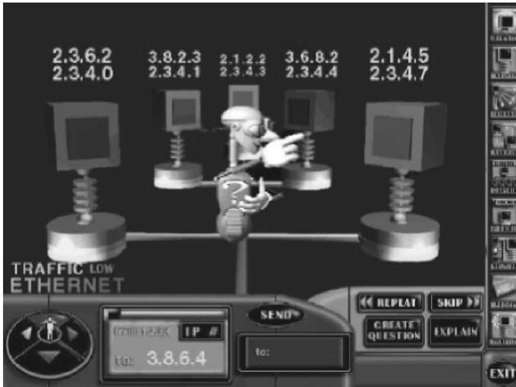
Figure 1. COSMO and the INTERNET ADVISOR learning environment