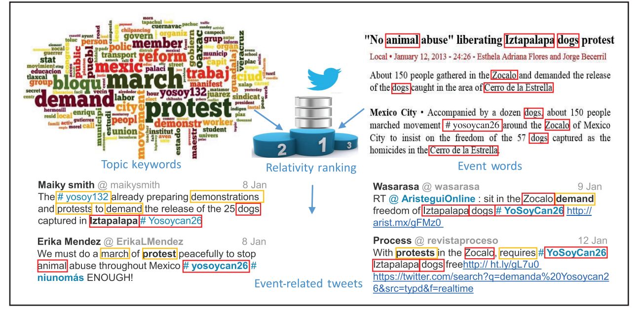
Figure 2. Event-related tweet extraction pipeline. Red boxes indicate event words for the street dog liberation protest in Mexico City and yellow boxes denote topic keywords. The word cloud in the top left shows top-ranked topic keywords for Mexico, generated from a database of 2,141 protest events in that country from January 2011 to September 2013. The tweets, originally in Spanish, have been translated into English using Google Translate.

inverse document frequency). The database, provided by MITRE, summarizes news reports from various global news outlets such as the